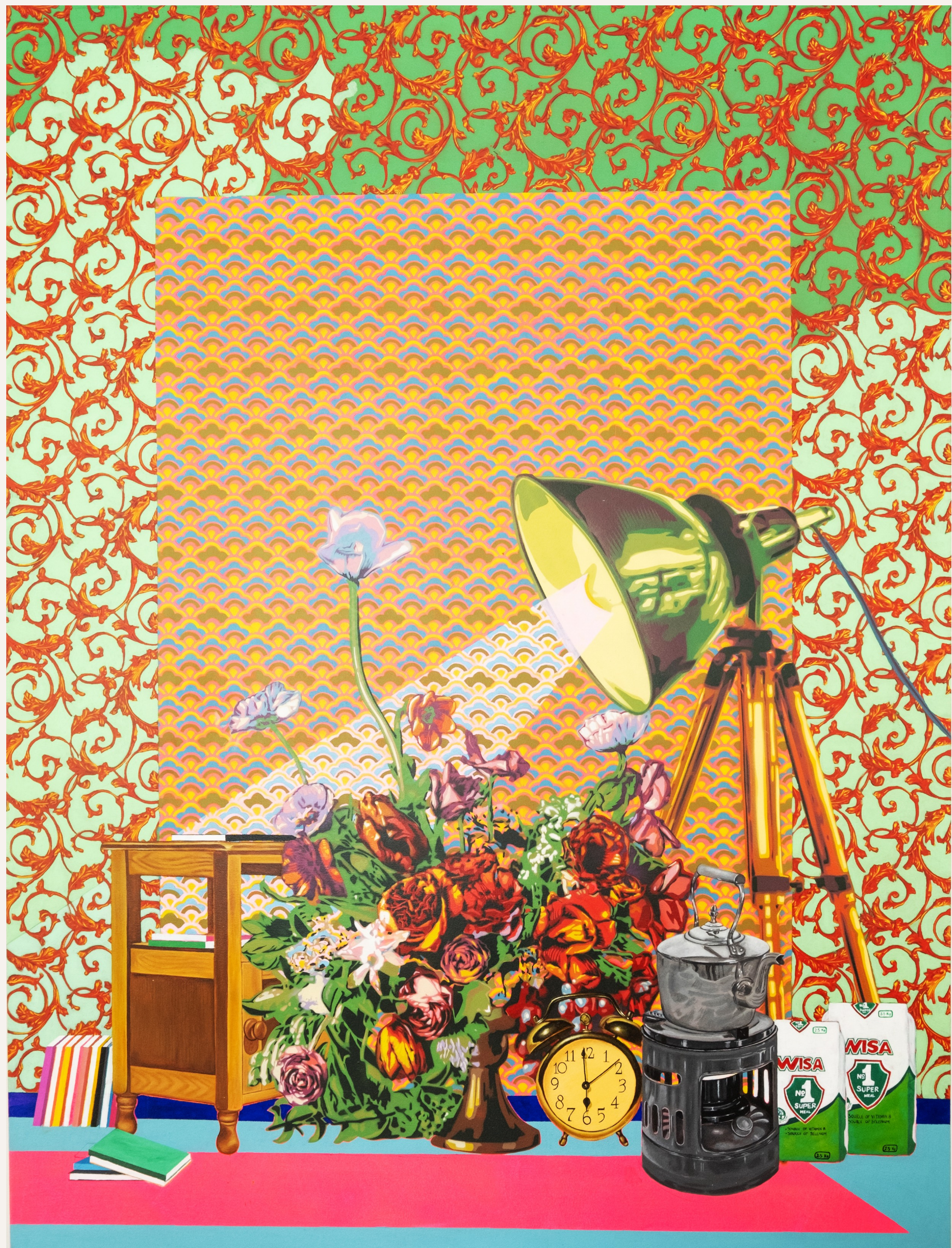
The Rainbow Nation (2023) Oil on canvas 200 x 150 x 5cm (80 x 60 x 2 inches) ZAR 200,000 excl 15% S.A vat