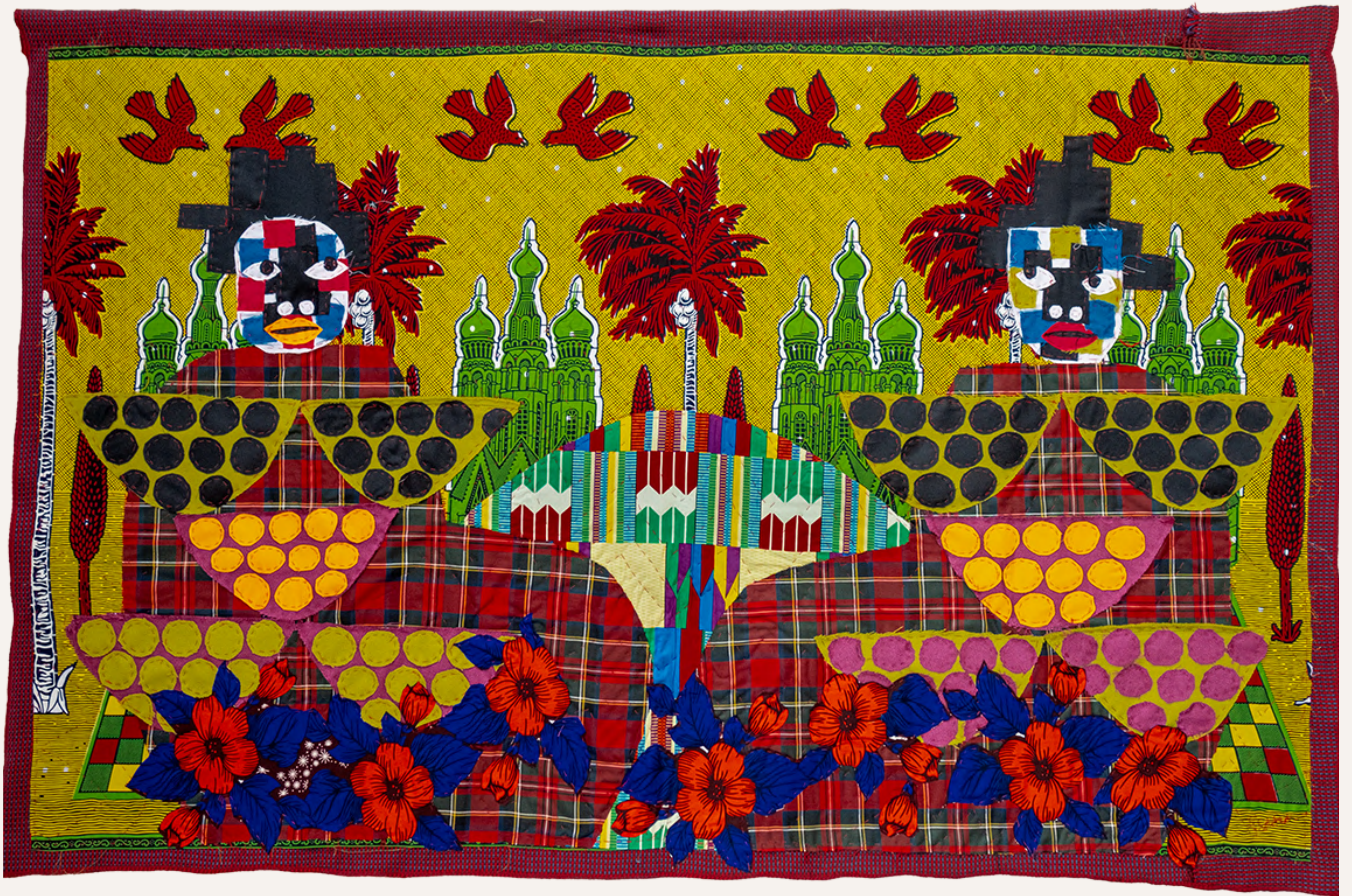
REPENT YOUR SINS (2023) Cotton, wax fabric, tweed, polyester 110 x 168 x 1cm (44 X 67.2 x 0.4 inches) USD 2,850 excl 15% SA vat