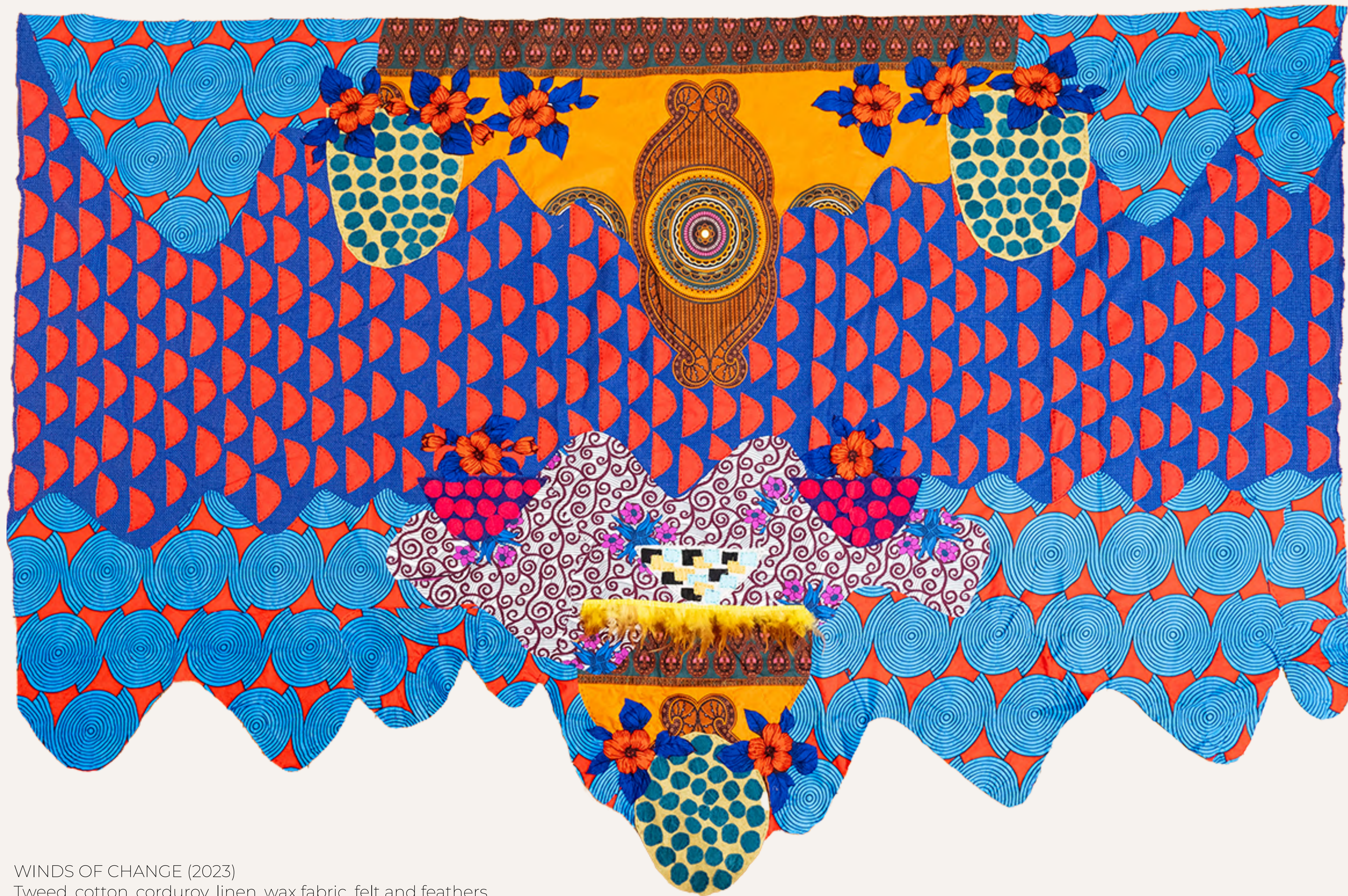
WINDS OF CHANGE (2023) Tweed, cotton, corduroy, linen, wax fabric, felt and feathers 200 x 311x 1cm (80x 124.4 x 0.4 inches) USD 4,300 excl 15% SA vat