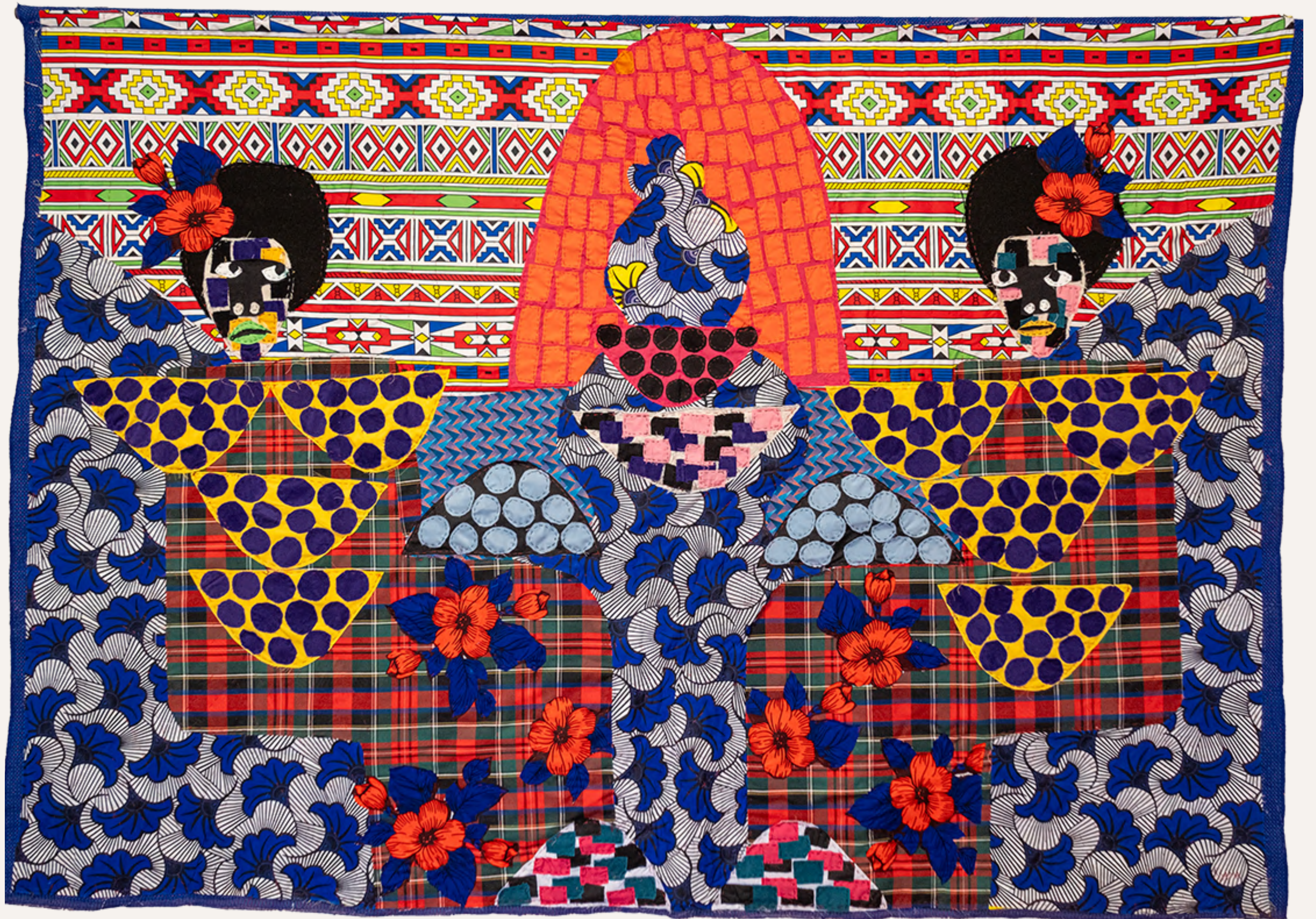
SHE READ HER FOR THE GODS! (2023) Corduroy, linen, wax fabric, tweed,, cotton 141 x 200 x 1cm (56.4 x 80 x 0.4 inches) USD 3,100 excl 15% SA vat