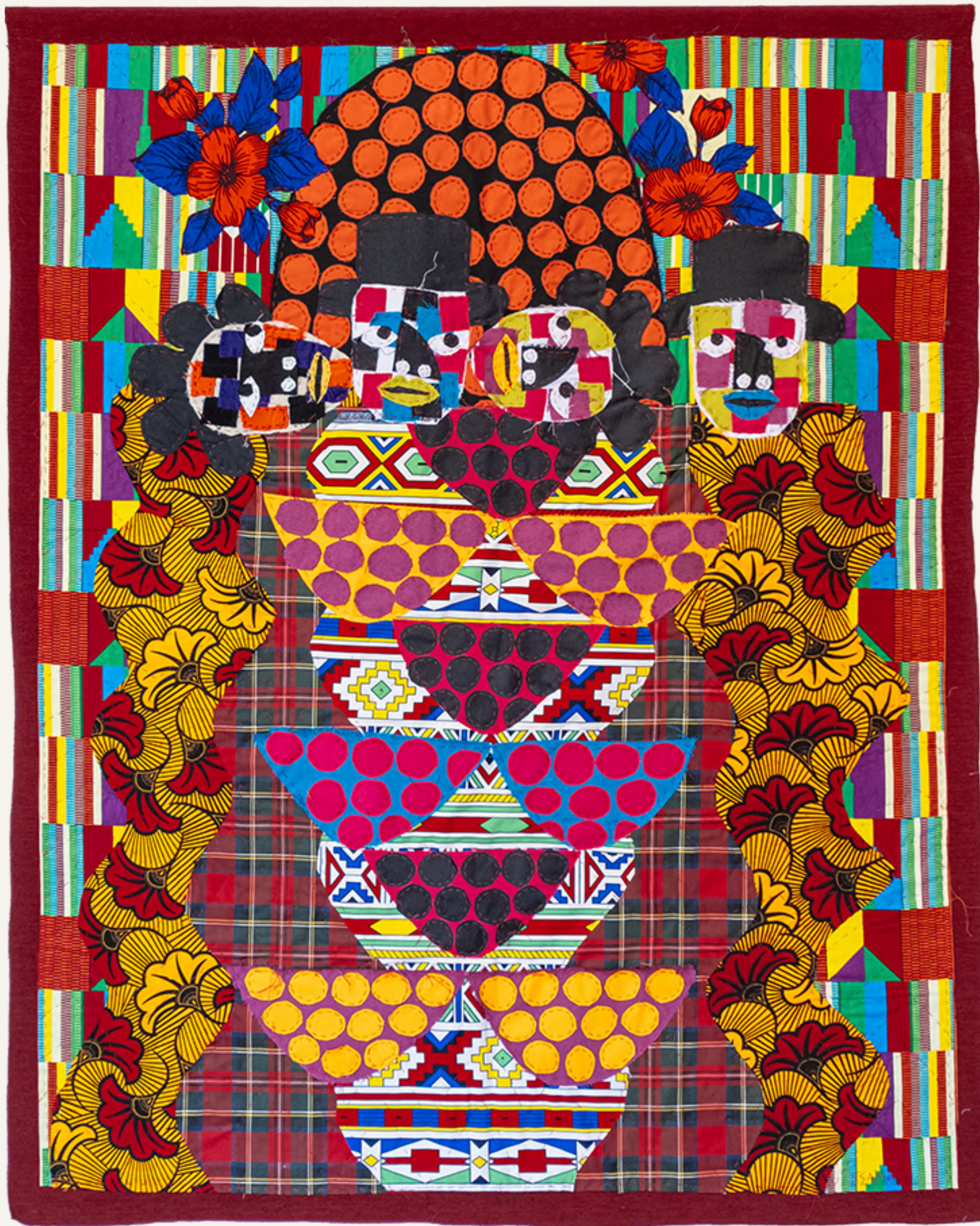
THE CONFESSION (2023) Tweed, cotton, wax fabric, polyester 151 x 122 x 1cm (60.4 x 48.8 x 0.4 inches) USD 2,500 excl 15% SA vat