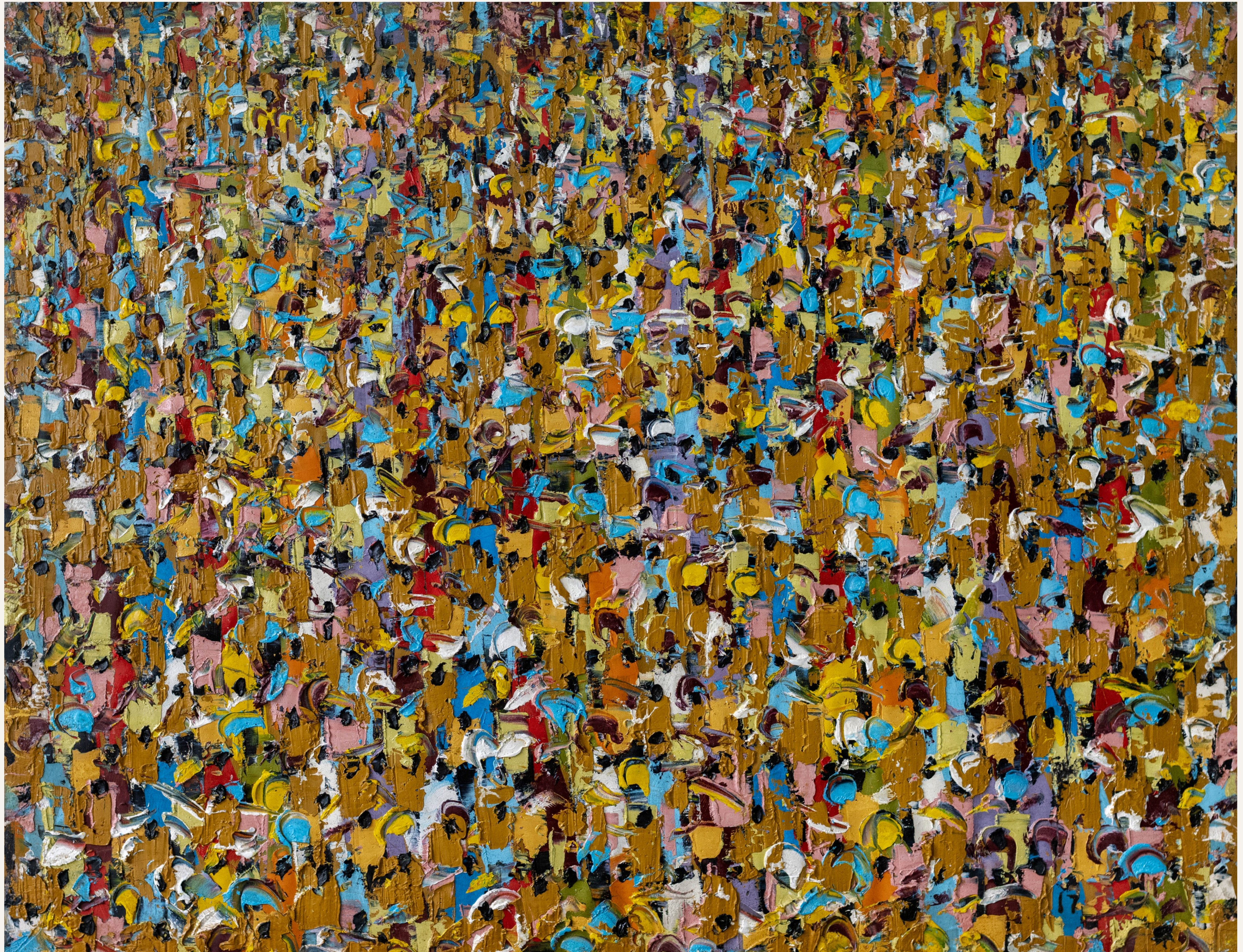
PEOPLE F16 17 Oil on canvas 101 x 125 cm (39.76 x 49.21 inches) USD 16 800 excl. 15% SA VAT