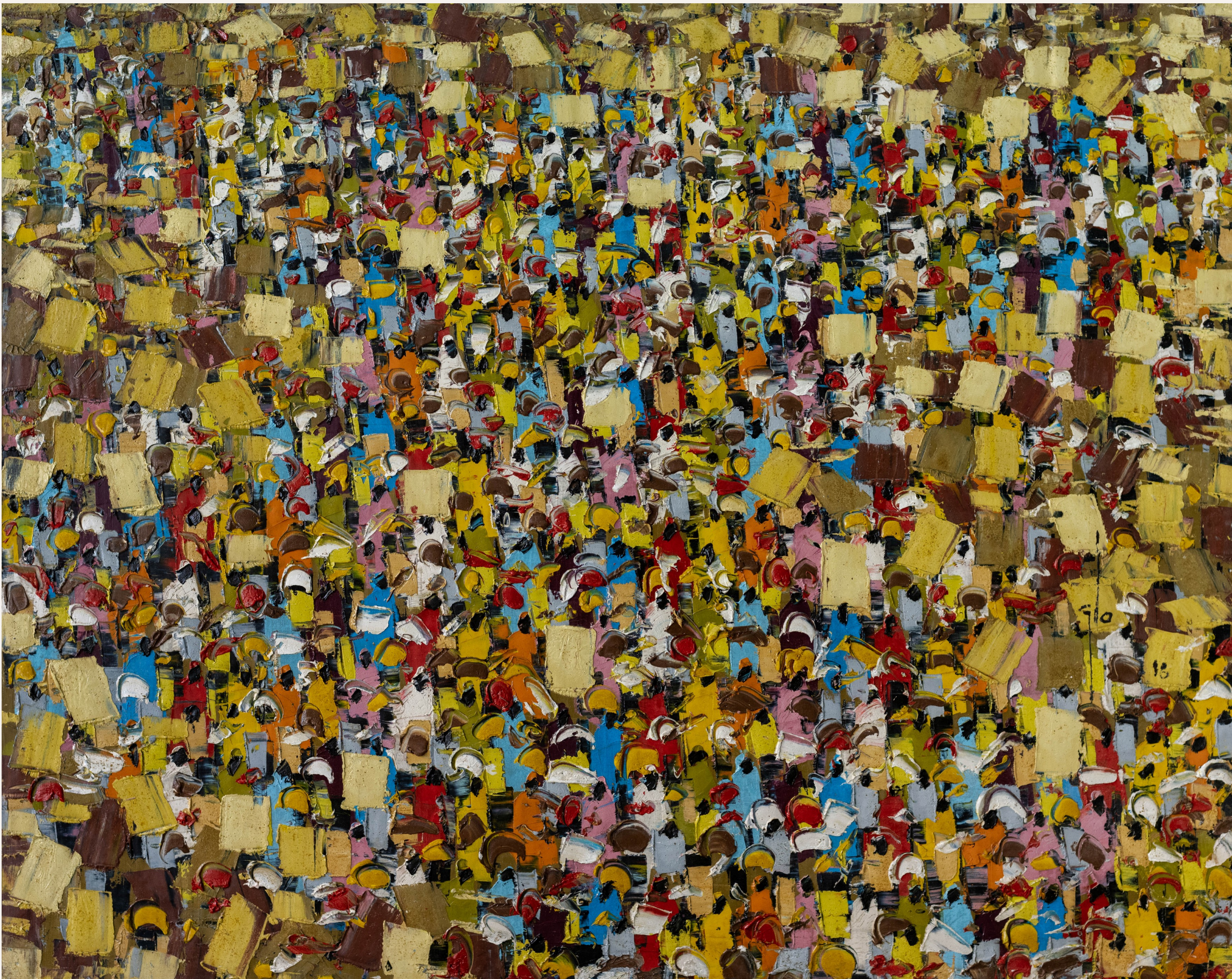
MARKET PLACE Prof 29/16 Oil on canvas 117 x 146 x (46.8 x 58.4 inches) USD 20,700 excl. 15% SA VAT