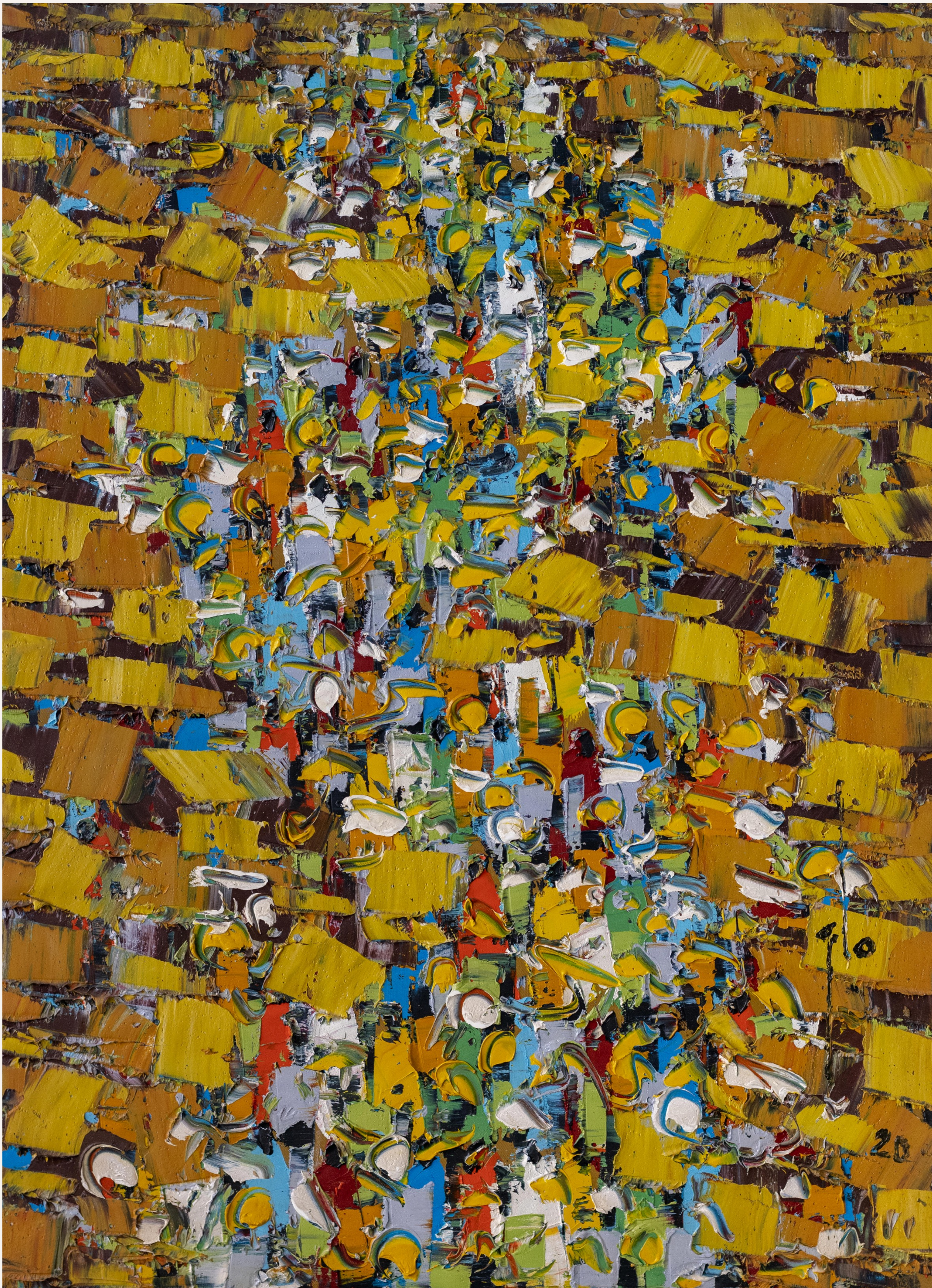
MARKET PLACE HSE71/20 Oil on canvas 101 x 75 cm (40.4 x 30 inches) USD 10 800 excl. 15% SA VAT