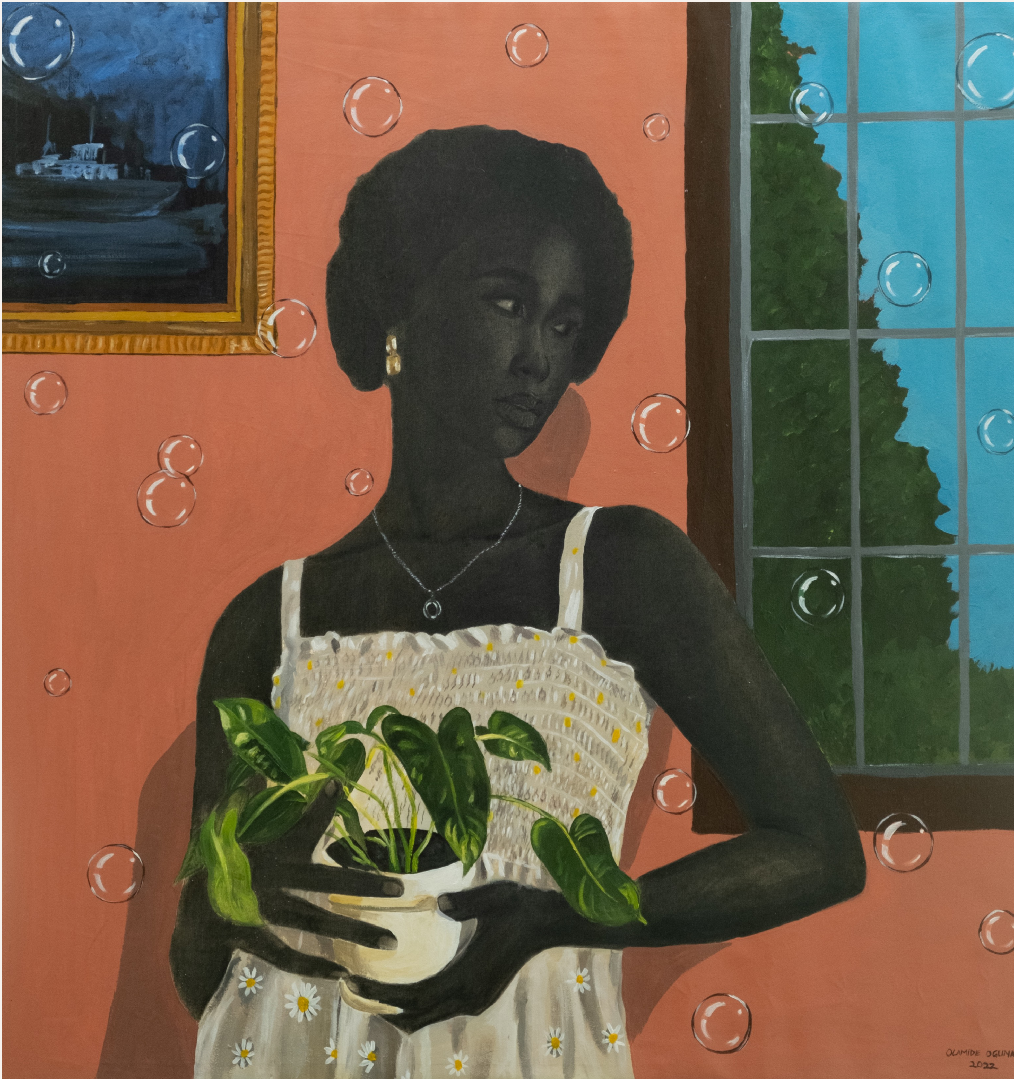
MY COMFORTER II (2022)

Charcoal & acrylic on canvas 76.5 x 75.5 cm (30.6 X 30.6 inches) USD 6,700 excl 15% vat