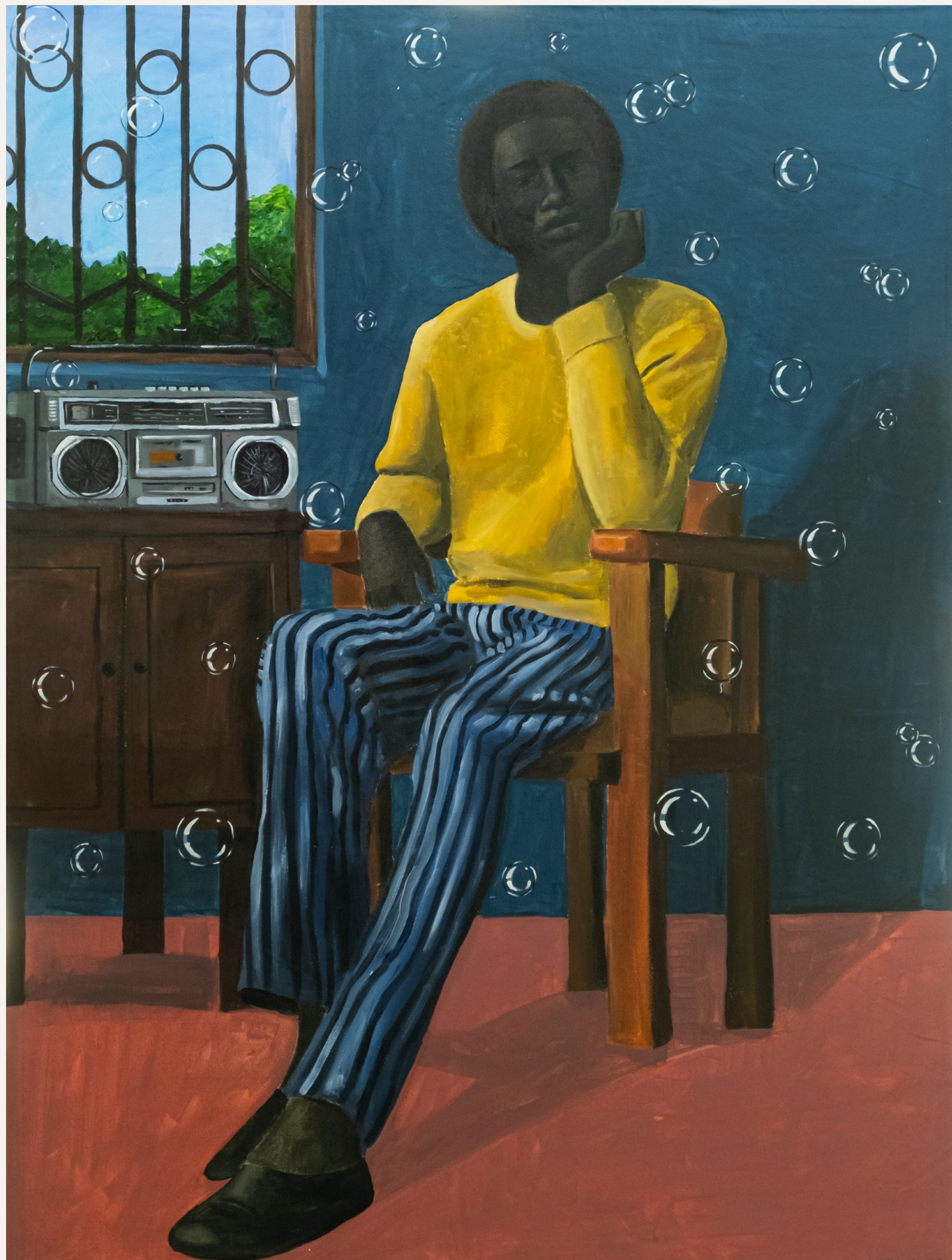
RADIO TIME (2022)

Charcoal & acrylic on canvas 121.5 x 91 cm (48.6 X 36.4 inches) USD 8,300 excl 15% vat