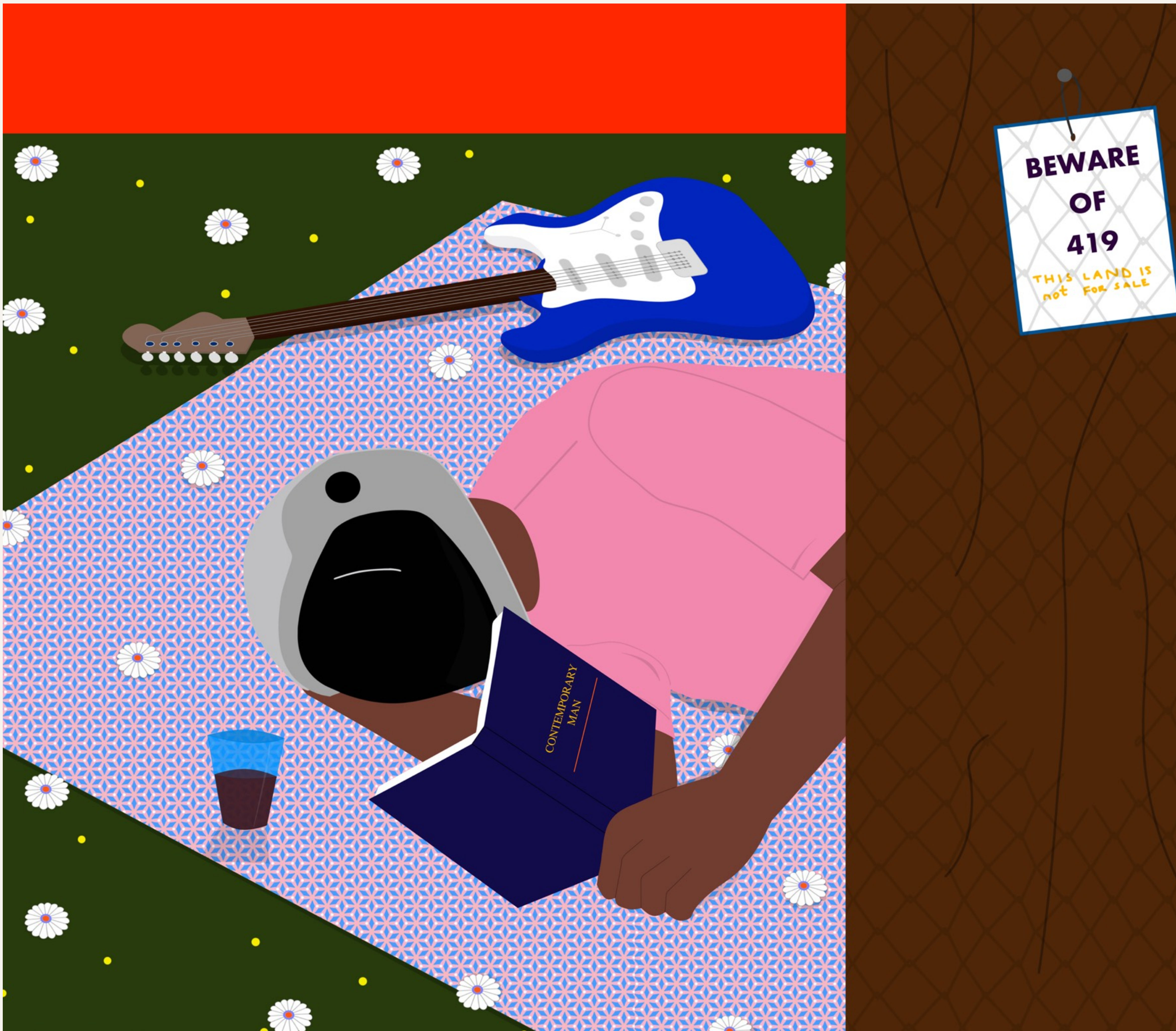
CONTEMPORARY MAN, FROM REMEMBER THE FUTURE SERIES (2018)

Digital & Acrylic on canvas, 85 x 100cm ( 34 x 40 inches) USD 20,000