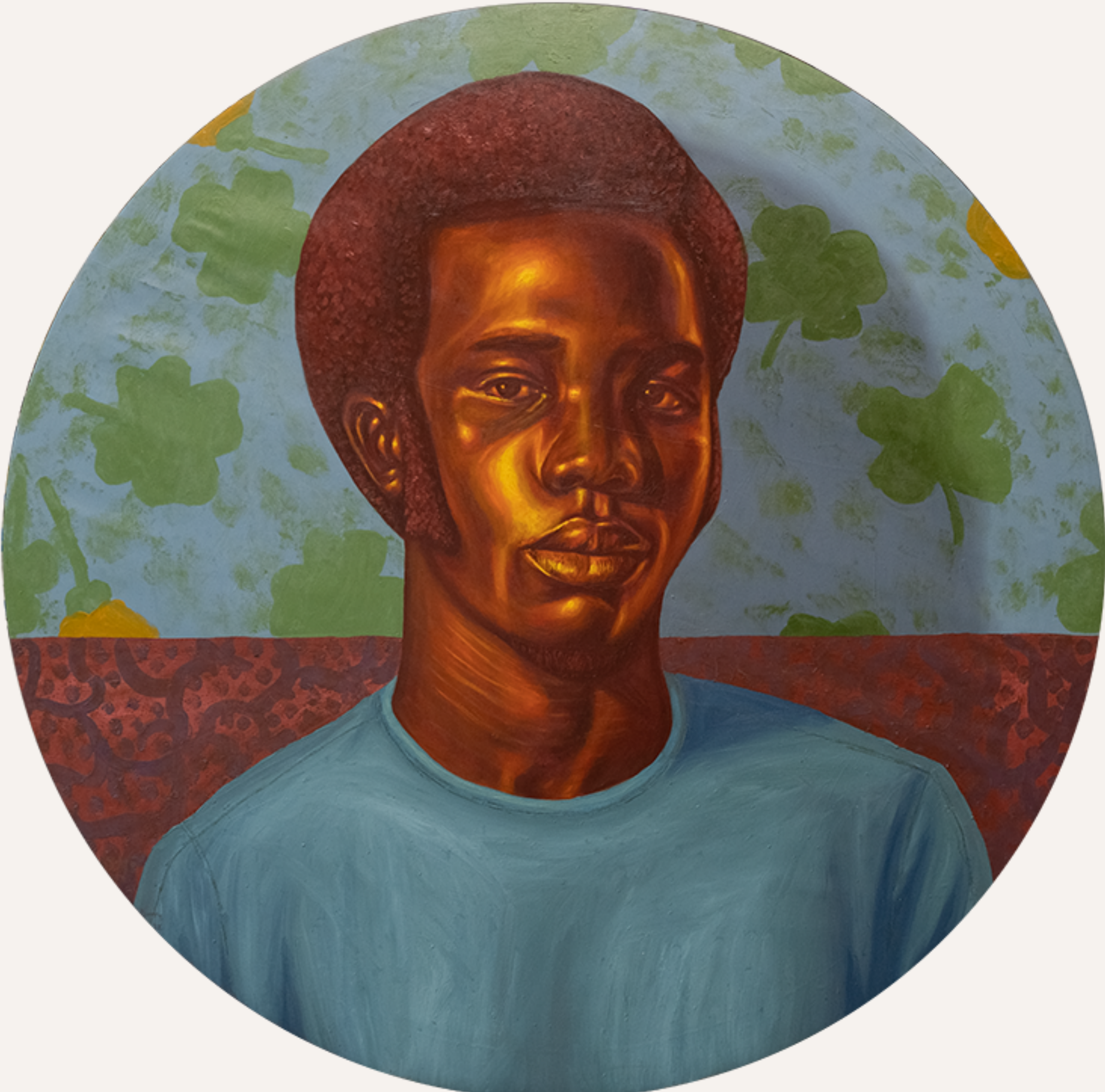
1986 JACK (2022)

Oil on canvas 125 x 125 cm (49.2 x 49.2 inches) USD 14 000 excl. 15% SA VAT